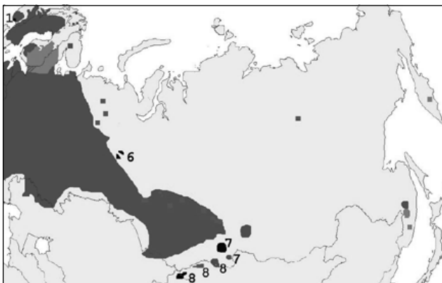
Figure 2. Distribution of both beaver species in Russia, Kazakhstan, Mongolia, and China. Traditional subspecies designations: 1 – Castor fiber fiber ; 6 – Castor fiber pohlei ; 7 – Castor fiber tuvnicus ; 8 – Castor fiber birulai . Dark grey shading represents the present range of Castor fiber (relict populations are marked in black); light grey shading represents the range of Castor canadensis

periphery of the main Russian range, in central Asia, and on the Amur of the Russian Far East. Although natural spread has contributed significantly to range and populations, most of the expansion is due to reintroductions, of which at least 205 have been recorded to distinct locations outside the former Soviet Union (FSU) (Halley and Rosell 2002). Within the former