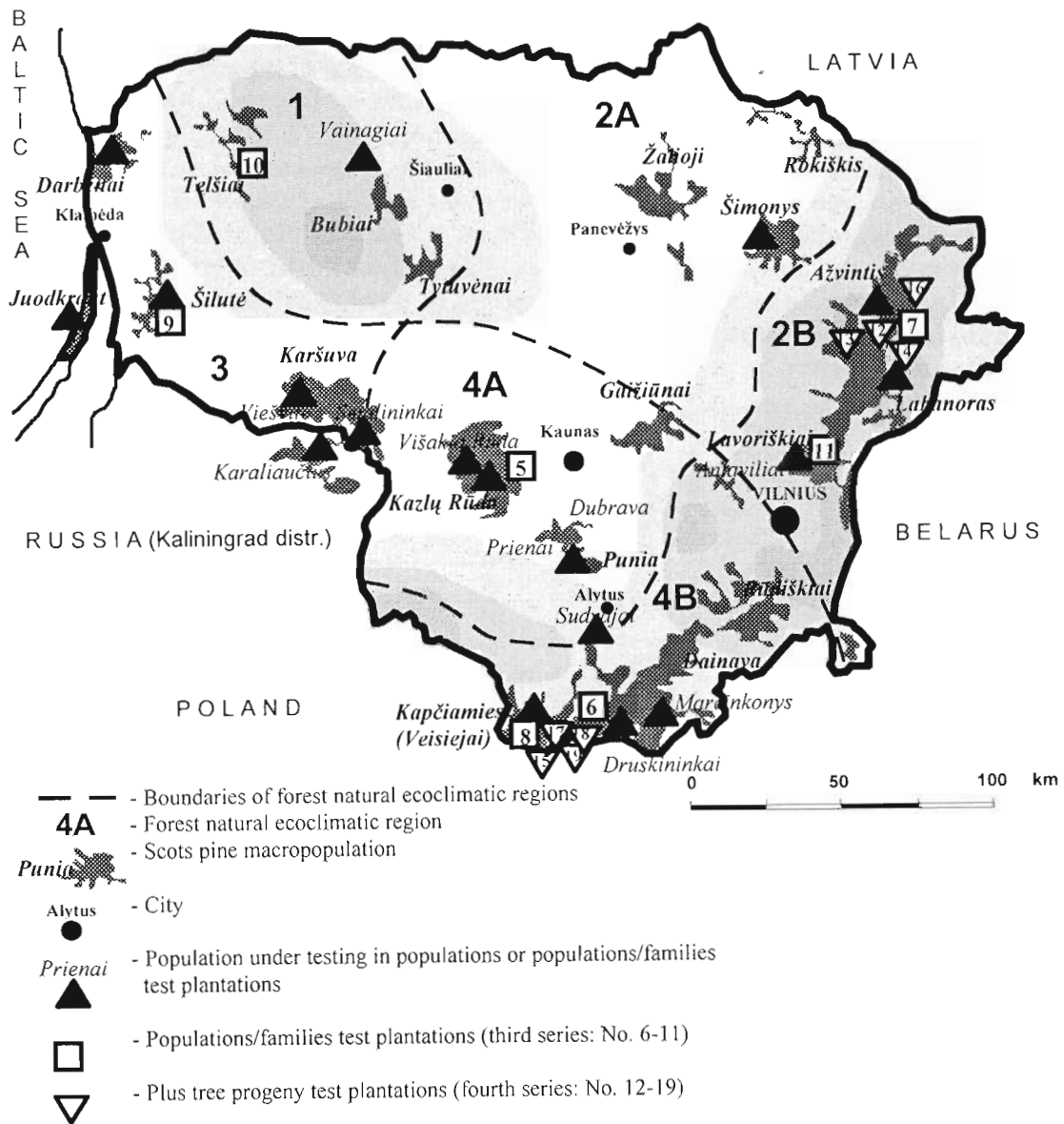
Fig. 2. Scots pine ( Pinus sylvestris L.) joint breeding and gene resource populations in Lithuania

al temperature variation, amount of precipitation, site fertility, and humidity have created a complicated geographical pattern of ecoclimatic conditions in Lithuania. Based on ecoclimatic characteristics, predominating site types, and forest vegetation, Lithuania was subdivided into six natural forest regions (Karazija, 1969, Fig. 2). These ecoclimatic gradients resulted in different growth rate, phenology and frost damage. This has promoted a differentiation among populations within the country. The results of our studies on Pinus sylvestris and Picea abies gene ecology confirm the existence of significant differences in growth and adaptedness of Lithuanian